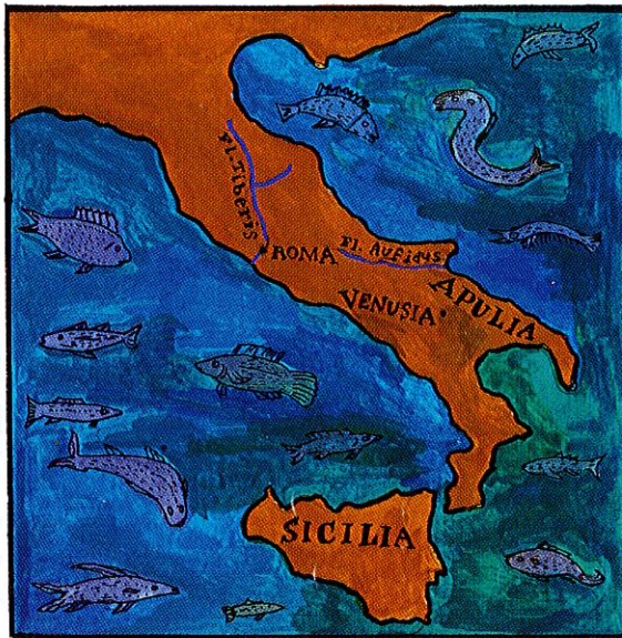
Quīntus in Apūliā habitat; Apūlia est in Italiā.